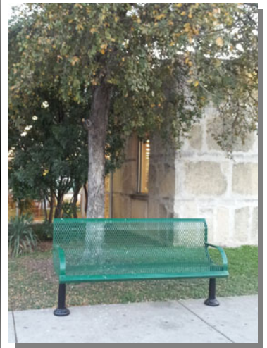
Great Northwest Friends purchased these great benches for their patrons to enjoy.