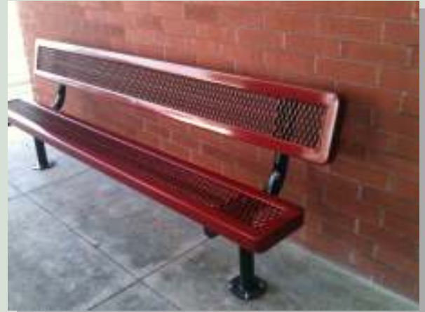
The Thousand Oaks Friends celebrated the arrival of the long-awaited outside benches at their monthly meeting. They admired the sleek design and the color that blended well with the brick wall, but were happiest about their part in providing a place for patrons to wait comfortably for rides or for the library to open.