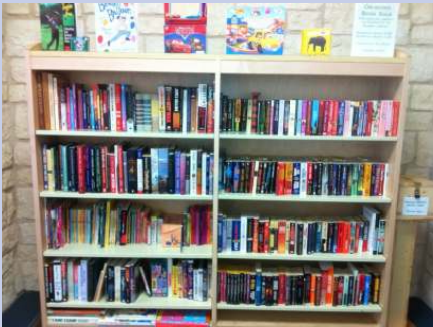
Parman has a new Book Nook in the lobby that offers an on-going book sale.