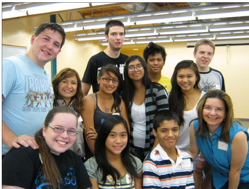
The Great Northwest Summer Youth Volunteers