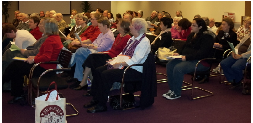
A full house was on hand at the Annual Meeting for the elections and announcement of Branch Best Friends.

The Friends of the Bazan Branch provided delicious, pretty cookies with branch names on them—almost too nice to eat!