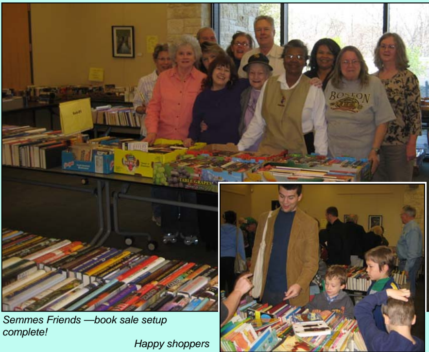
Semmes Friends —book sale setup complete!