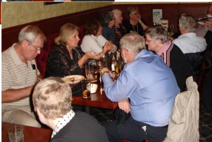
The Brook Hollow Friends started the New Year with a bang by hosting a Library Staff Appreciation Dinner, at the Lion & Rose Restaurant in Stone Oak.