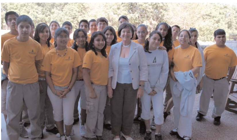
Scout and students from KIPP Aspire Academy