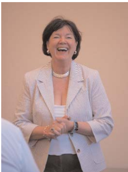
Scout - during her presentation