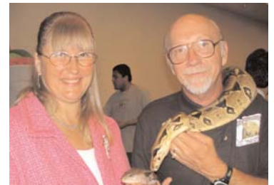
Representatives from the South Texas Herpetology Association at a Summer Reading appearance. The educational live reptile program was one of the Summer Reading activities sponsored by FOSAPL.