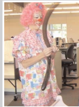
A clown added to the festivities.