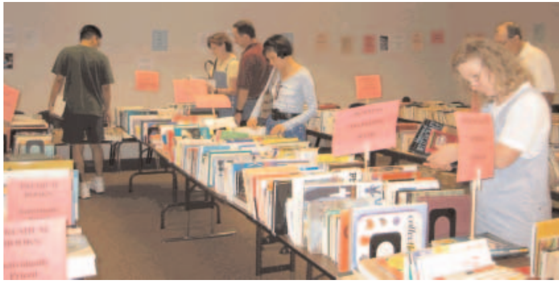
By late morning, we had sold hundreds of books, but even after the big morning rush was over, people still found lots of great bargains.

The Brook Hollow Friends held our semi-annual book sale May 15. It was a big success, not just because of the money we raised, but also because more than 20 of our members helped with the sale! We had a great time.