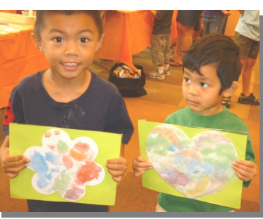
Sand Art Craft - 7/26/2012