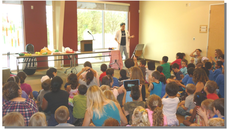
Mad Science - 7/19/2012