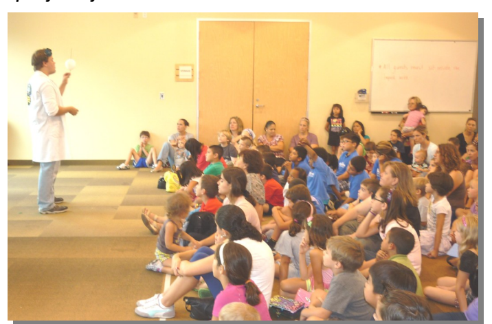
Mad Science - 7/19/2012