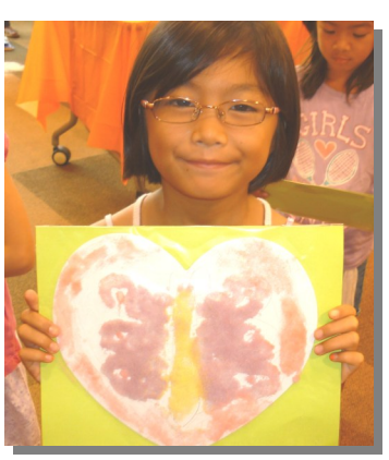
Sand Art Craft - 7/26/2012