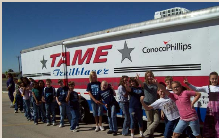
The TAME Trailblazer, a mobile science and engineering exhibit trailer will visit Mission Branch from 10 a.m. to 5 p.m. on Friday, July 27.