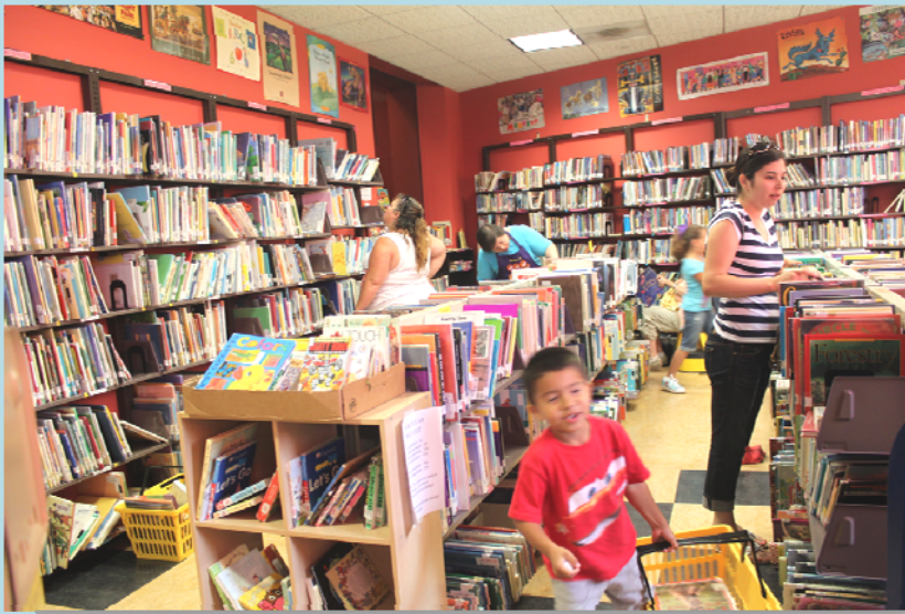
BookCellar children's area