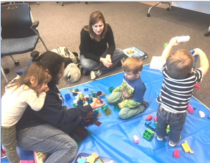
Enjoying a bilingual story time at Las Palmas.