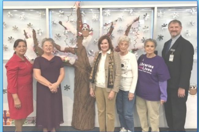
Thousand Oaks branch manager (right) and Friends