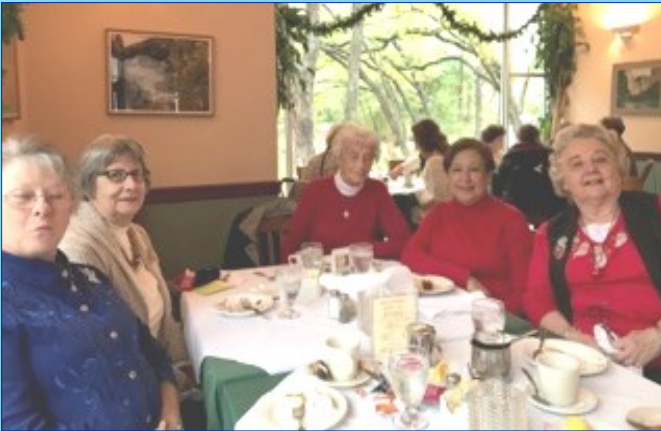
Thousand Oaks Friends enjoying their Christmas luncheon.