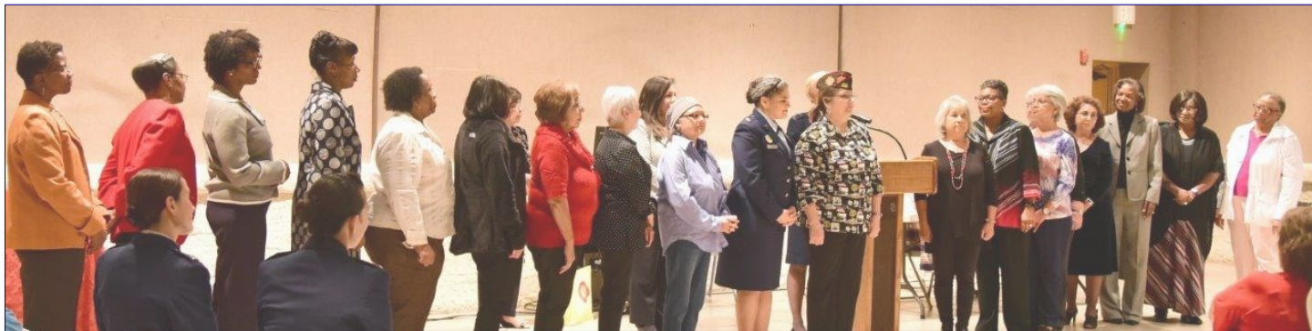
Honorees at Las Palmas Friends' Veterans Day Observance recognition ceremony.