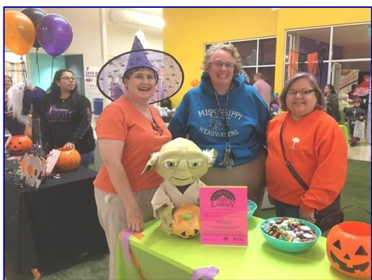
The Friends of Potrancó had a table at the Boo Bash that was very well attended.