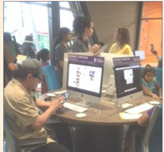
Patrons busy at the computer stations