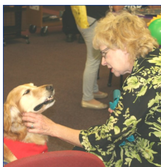
Memorial celebrated with, a classical Indian dance performance (Bharatanatyam) among other activities including a visit with Foxie, a therapy dog.