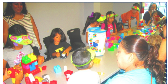
Summertime fun: Bilingual Story Time at Las Palmas Library.