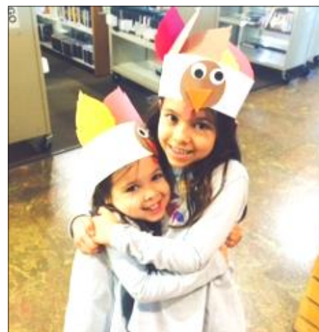
Thanksgiving art projects at Igo.