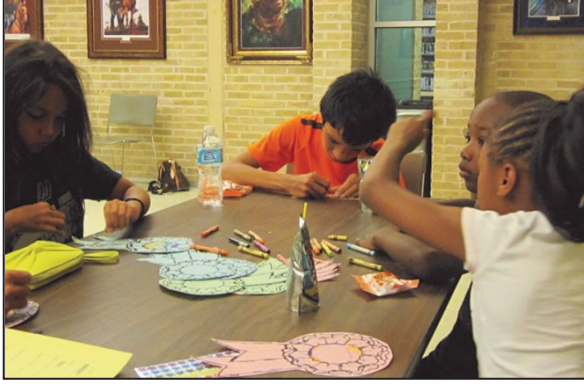
Summerfest at Carver