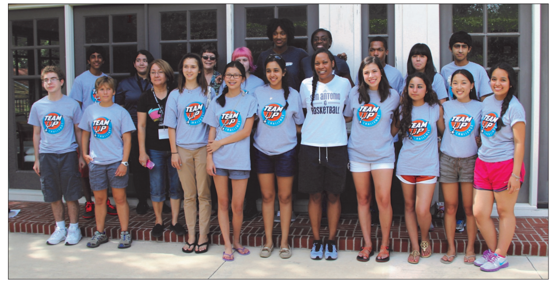
Landa Teen Library Leadership Council (TLLC)