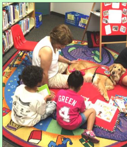
Foxy, a therapy dog, visited Pan American Library during their book sale October 18.