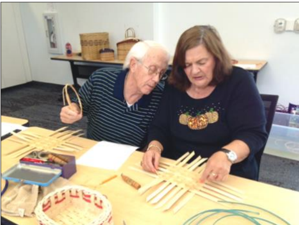
One of the Parman DIY classes – basket weaving