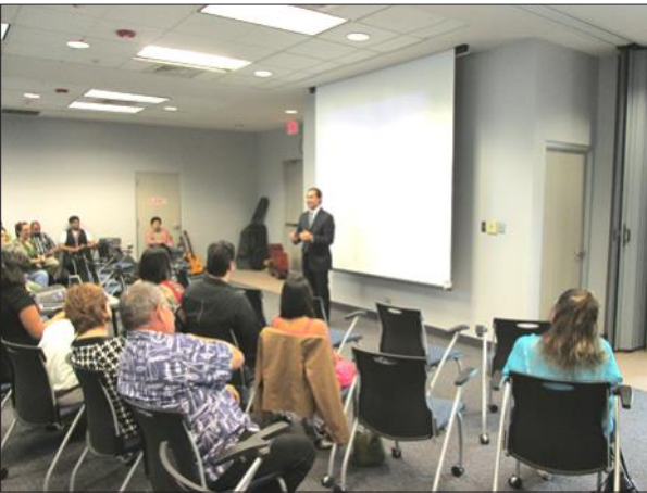
Congressman Joaquin Castro at the review of Willie Velasquez's book, Boy Made of Lightning .