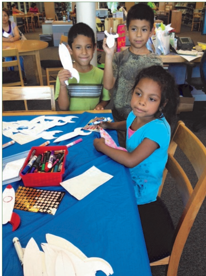
Children decorating their "Come and Go Crafts" rockets during the Las Palmas friends book sale on June 7.