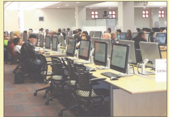
Connect at Central Library.

Additional information about SAPL and Connect can be found at www.mysapl.org .