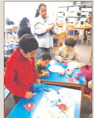
Las Palmas Friends sponsored a Christmas crafts activity during the December book sale.