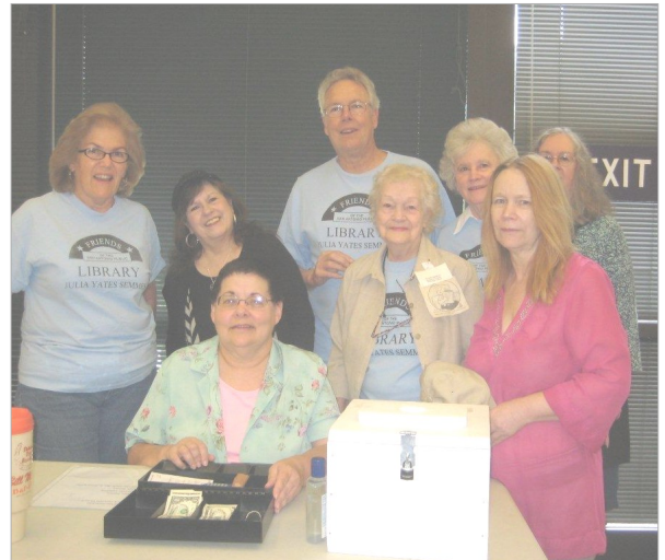
Semmes motley book sale crew!