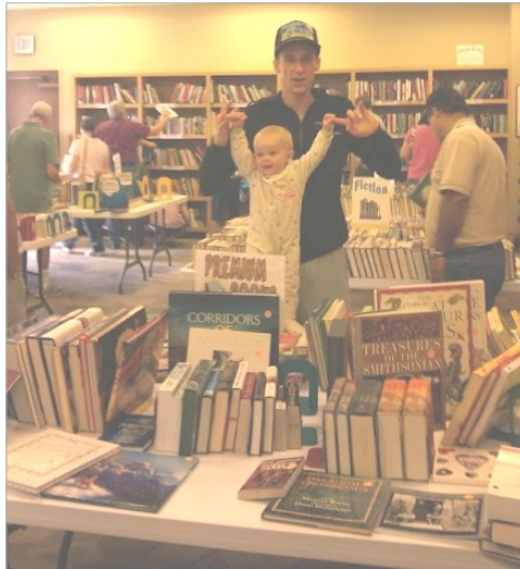
Premium book baby at Maverick book sale